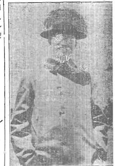
Hardly anyone recognized this individual as Gene Tunney when he stepped from the gangplank of the H. M. S. "Promise" the other day. It was the editor of the Larceny Muse returning from a 90-day vacation in Jackson, Mich.

(Editor's Note: It was learned later that it WAS Gene Tunney).