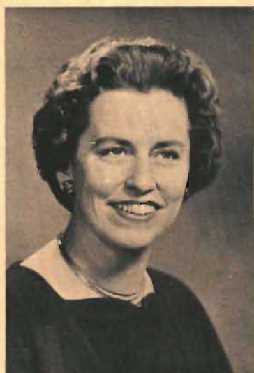
Rep. Martha Griffiths