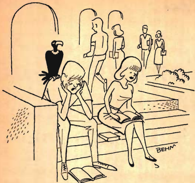
I've got an uneasy feeling about the final.